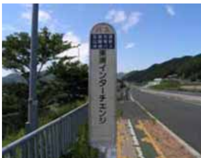
① Bus stop