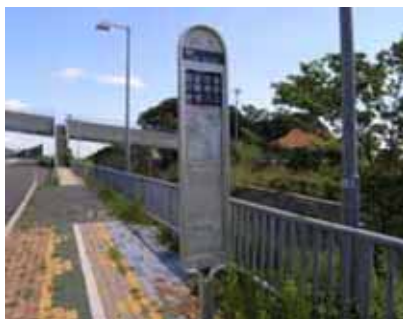
② To walking bridge