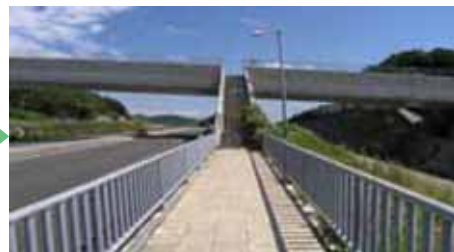
③ Walking bridge stair