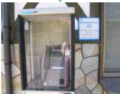
⑦ Telephone booth

Call a taxi from this pay phone. A taxi will come to pick you up in about 10 minutes. Please be advised to bring ¥10 or ¥100 coins to use this coin operated pay phone. It takes about 10 minutes to get to the Westin Awaji Island. The fare is about ¥1,600. The staff at the Westin Awaji Island will arrange a taxi for overseas visitors. The Westin Awaji Island phone: 0799-74-1111