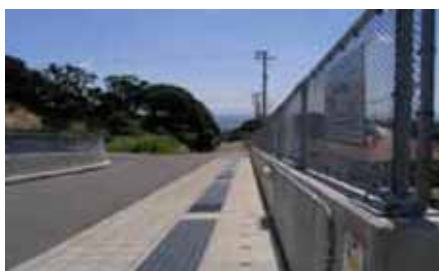
⑤ Walking bridge