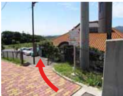
⑥ Yamadahara Kaikan