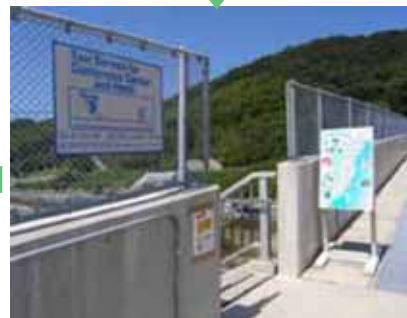
④ Walking bridge sign